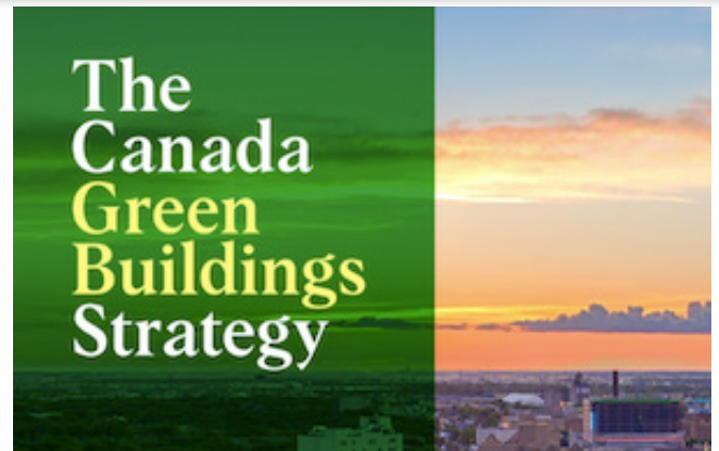
Click for image for full article

Buildings are the third largest emitting sector, after oil and gas and transportation. And importantly, it is a challenging sector to decarbonize because we must all do it, together. To succeed, close collaboration is needed between the federal government, provinces, municipalities, indigenous groups, businesses, financial institutions, and industry. There are 16 million homes and half a million other buildings standing in Canada today and most of these are expected to still be standing in 2050. Each home and building owner has a role to play in this sector to upgrade and retrofit these spaces to significantly reduce emissions in that time. The scale of this renewal requires annual