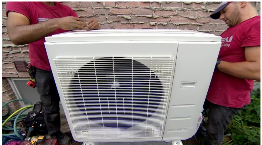
A new pump is installed at a home to replace both an old air conditioner and a natural gas furnace.